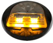
Amber LGS-M10 RWL with 10" Composite Baseplate