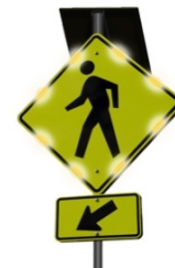
Solar Wireless Pedestrian Warning LED Sign System