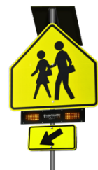
Solar Wireless School Crossing RRFB System

NOTE: In-Roadway Warning Lights (IRWLs) are available in amber, red and green with 10" composite, or 14" snow plow blade resistant baseplates. Radar, RADs, passive pedestrian detection sensor bollards, and push button activation methods are available. Controllers are customizable to interface with round beacons, and other output devices not mentioned above. Poles not included.