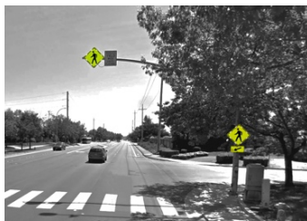
LED School Crossing Sign System – overhead mast & curb mounted